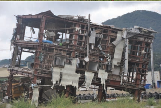
Onagawa town, overturned building (above) Only skeletal frames remaining (below)