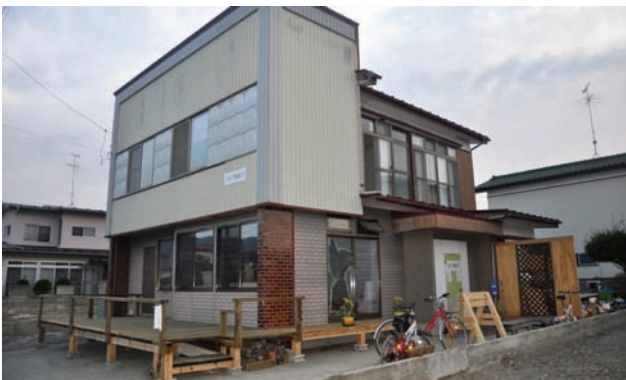
The Help Tohoku base where the weekly open café was held and is a place for meetings as well as team accommodation. 19 people stayed there on the last day, including our team