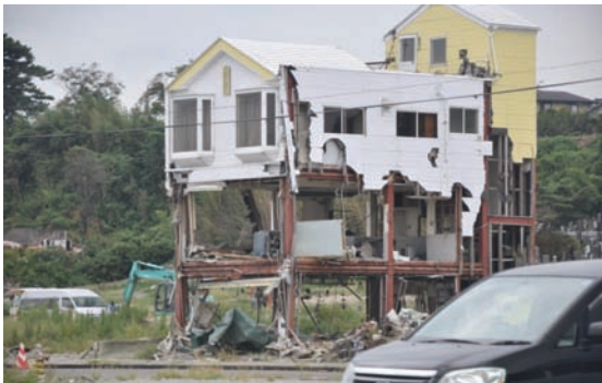
Ishinomaki City ruins (above, below)

Even though the tsunami hit area is very large, Ishinomaki has been chosen as the base for many Christian organizations and groups. With a population of 160,000, the city was one of the hardest hit with a large death or missing toll of close to 4000 people. Almost 50% of the city was inundated by the tsunami, leaving many buildings and homes damaged or beyond repair. Where the team worked was in a small town where most homes were half wrecked by being flooded up to the first floor and nearly 180 people died in little town alone.