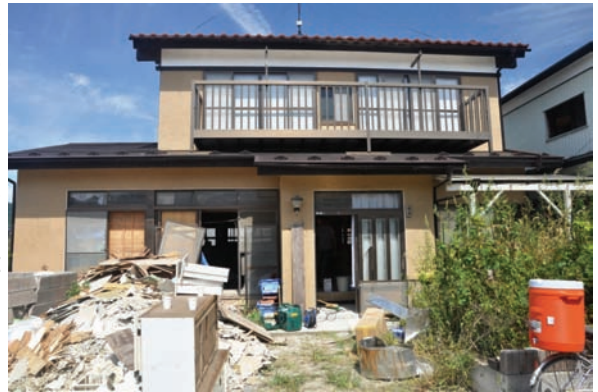
Girls' house (Yoshida residence). The girls slept on the floors of the 2 rooms in the upper floor.

We all checked in at two residential homes (boys & girls separately); we slept on the 2 nd floor of homes that we were to work in; no electricity, no water, no working bathrooms. Since we had no bathrooms, we had to go to a local bath-house for our evening showers. We had a taste of what the tsunami survivors experienced for weeks & months. Yet, despite the inconvenience, this was a great improvement from the original plan which was to sleep in tents. We did manual labor during the day, and took part in the open café the local residents could drop in and chat over coffee. On the final day, September 14 we went out on a survey of ground zero areas of Onagawa City and Central Ishinomaki. It was heart breaking to see areas where there was literally nothing left standing.