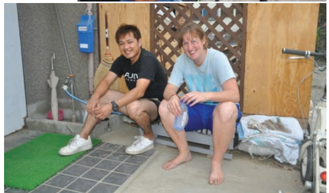
Some of the long term missionaries. We thank each one of them for being a living example of living by faith and using everything they have to witness for Jesus in this hard place.